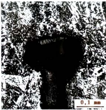
Fig. 1 Corrosion cavern in the welding joint of a gas recipient

Starting from these considerations the paper shows 3 cases of failures (gas recipient- fig. 1; connecting screw – fig. 2; syringe needle – fig. 3) for which the corrosion phenomena was the determinant factor leading to the malfunction of the product.