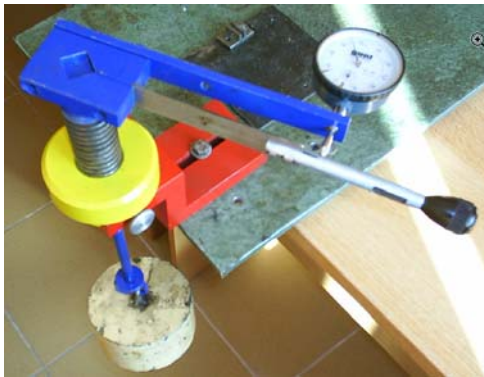
Fig. 1. Test rig

Abstract: In order to optimize mechanical systems, is extremely important to understand the friction phenomena from different mechanical pairs. For the case of screw-nut pairs, sliding frictional forces are distributed over the thread surfaces in a complex manner. A test rig was constructed to study the friction from a screw–nut pair, with both elements made of steel, is shown in Fig. 1. After calibrating the driving-measuring system, Fig. 2, sets of test were run and an average value of the friction coefficient was computed. It was noticed a small tendency of decreasing for friction coefficient with increasing loading force and this was attributed to a better behaviour under lubrication, as seen in plots from Fig. 3.