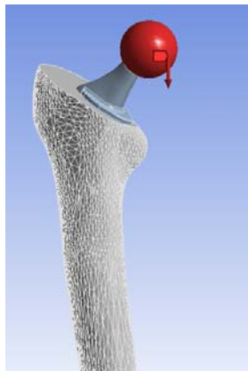
Fig.1. Reaction force H_y .

The longevity of cementless total joints can be increased by improving implant-bone fit. This paper describes one method to generate a 3D femur model with the help of X-ray computerized tomography. The femoral medullar canal shape was used for the design of the stem prosthesis. A set of three stems were design and simulated in order to decide which one is the most suitable for the patient. The resulted implant design optimizes load transfer and minimizes stem motion within a given bone.