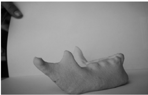
Fig.1. Model 3D mandibular prothesis

The powders Ti-HA are used in implantology, for fingers and for mandibular implants. (fig.1,2)