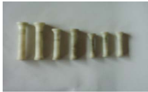
Fig.2. Models 3D phalangeal prothesis

On makes probes with constant concentration (5, 10, 15, 20% HA) to study the bioactivity în simulated organic fluid (SBF). On remark the presence of bioactive phase and realization of new calcium phosphates. (fig.3, 4)