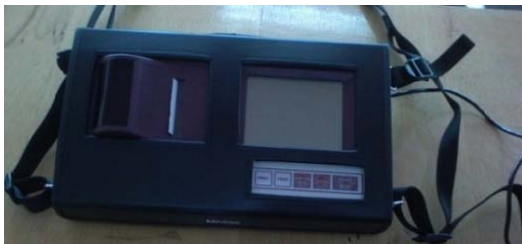
Fig.1 Portable roughness tester

The gauge designed for testing the roughness was a. It is a super-compact, mobile, accuracy tool, meaning the result of the most current technological researches.