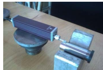
Fig. 2 Positioning the feeding unit on the part

The results of the measurements have been the following :