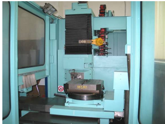
Fig. 2 – (left over) -The APC at the TMA AL 550 machine, [3].