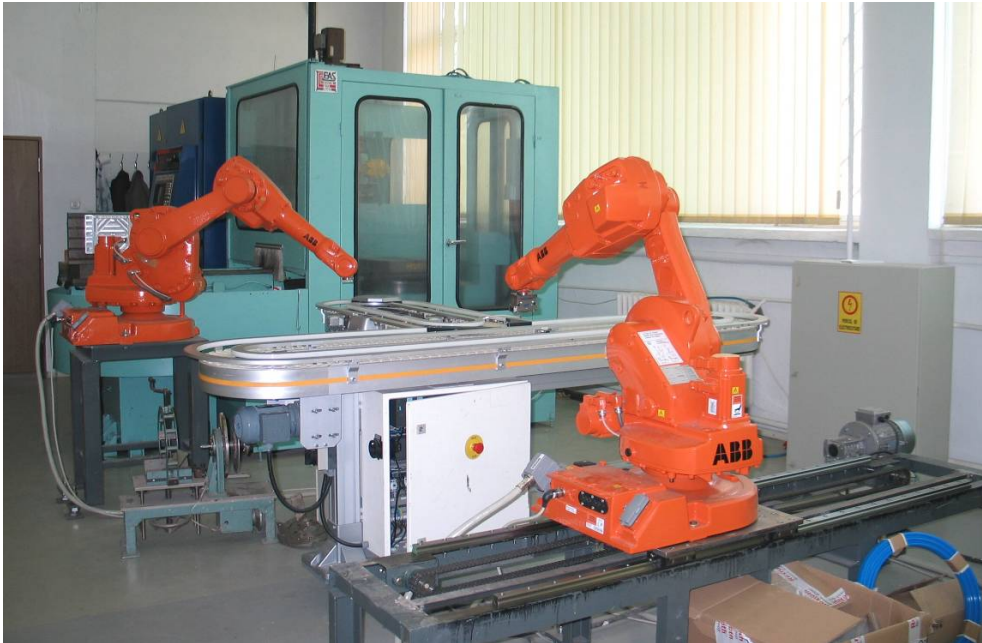
Fig. 1 – The general view on the actual laboratory

-- the integration of one modular tooling system in order to assures the ATR function