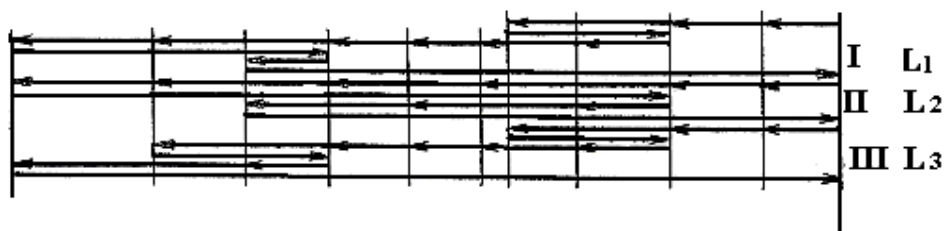
Fig.2. The cutting tool motion path at processing the stepped shaft

The scheme of dimension chains is shown in Figure 1 and in Fig.2 is shown the travel path of the cutting tool at stepped shaft processing. Checking correctness is done as in Fig.2.